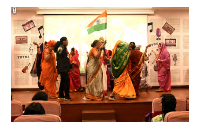
Session on Sound Healing